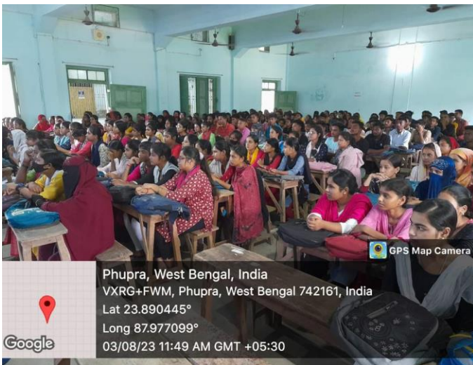
GIRL'S COMMON ROOM