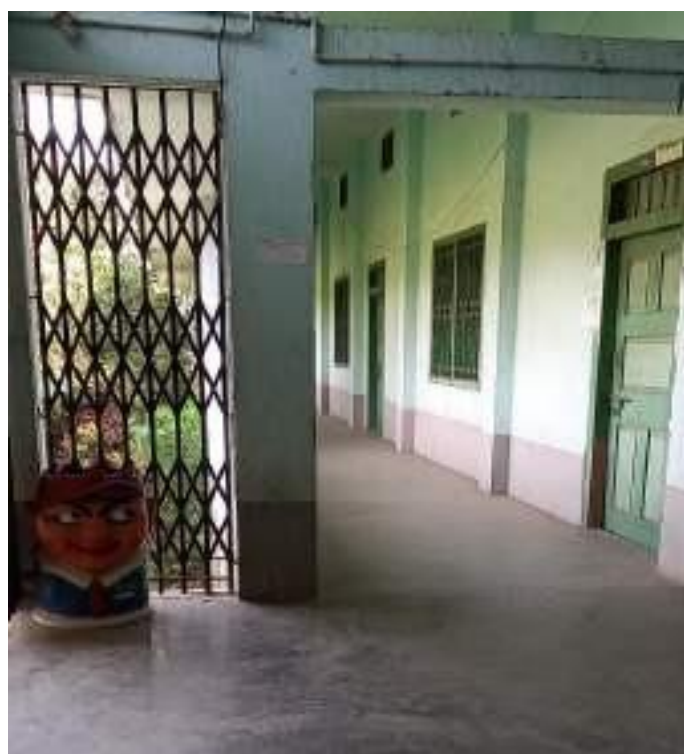
Large size dustbins