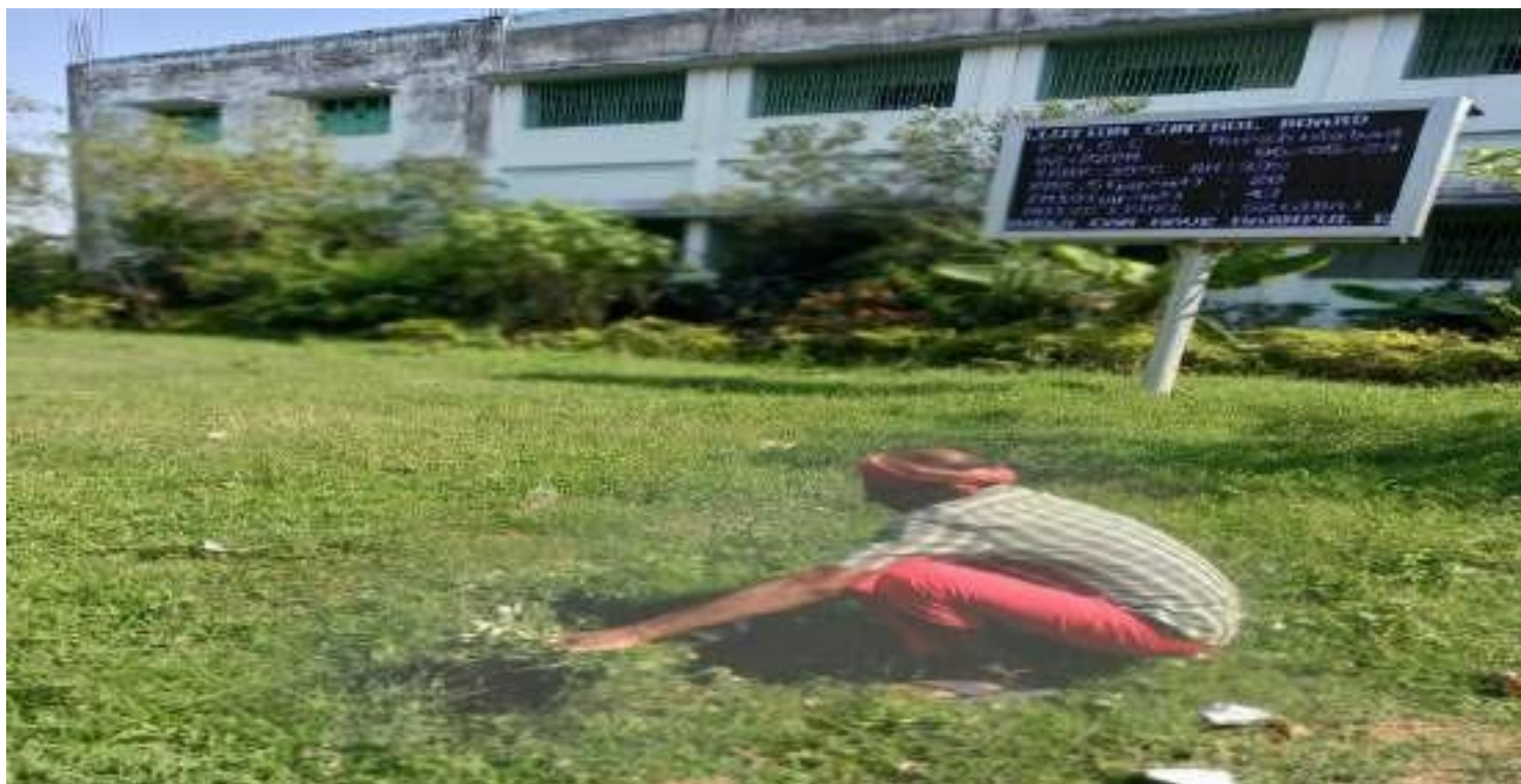
Plant clippings are used by local villagers in cattle feeding